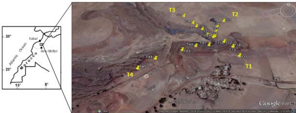
Figure 1. Location map of the study area and topsoil samples.

Surface soil was collected at the site of Ait Ammar iron mine ( 33^{\circ} 04' N ; 6^{\circ} 38' W ), which is located in the Khouribga Province, Morocco. The region's climate is Mediterranean arid to semi-arid. 14 Four sampling transects (T1, T2, T3, and T4) were selected based along the direction of iron deposits. Five sampling sites were selected along each transect, with the most distance point being 300-600 m from the first transect point (Figure 1). So, five sampling rounds (R1, R2, R3, R4 and R5) were determined based along the distance of iron deposits (e.g. R1 contained T11, T21, T31 and T41).