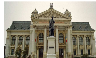
„V. Alecsandri” Theatre