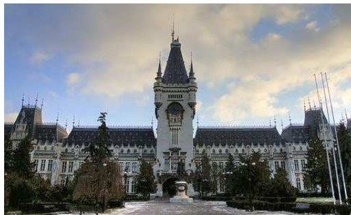
The Palace of Culture in Iasi

http://www.turistik.ro/romania/iasi/palatul-culturii-