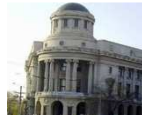
„M. Eminescu” Central Universitar Library